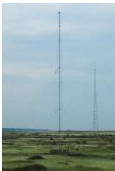
Radio Caroline's AM transmitter site at Orfordness

Weather and technology permitting, Radio Caroline programmes on 648Khz AM will commence (originating from the Ross Revenge ) at 7.00am on Friday 22nd December.