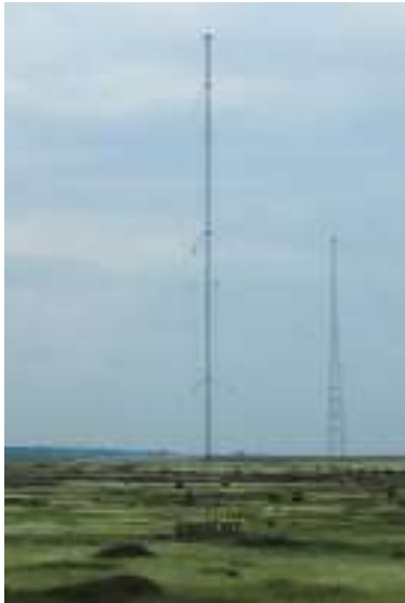
Radio Caroline's AM transmitter site at Orfordness

Weather and technology permitting, Radio Caroline programmes on 648Khz AM will commence (originating from the Ross Revenge ) at 7.00am on Friday 22nd December.